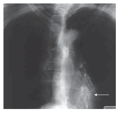
Figure 1 C. Chest x-ray in supine position revealed barium in the left bronchial tree, and to a lesser extent in the trachea and the right bronchial tree.