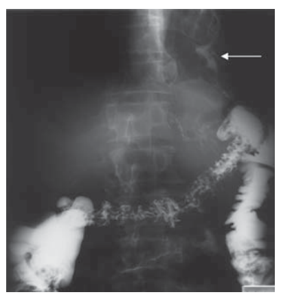
Figure 1 B. Abdominal plain film of double contrast barium enema showing fistula channel filled with barium arising from splenic flexure of the colon spreading towards the left lower lung base.